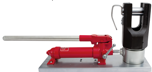
Hydraulic Tool No. 635