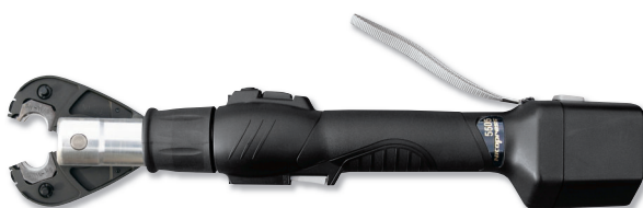
Nicopress Battery-Powered Tools