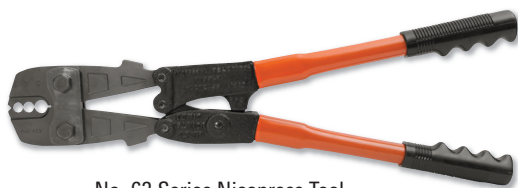
No. 63 Series Nicopress Tool