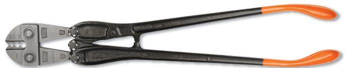
No. 3 Series Nicopress Tool